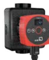
Calio S: The clever circulator, ideal for use in single and multiple dwellings