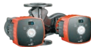
Calio Z: Dual pump management with automatic pump changeover, changeover and peak load operation in the event of a fault

Innovative solutions, short response times and comprehensive support from a single source. KSB is your perfect partner – from planning through to implementation. The right answer to all questions: www.ksb.com/service