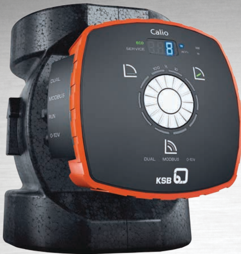
Calio with thermal insulation

Maximum energy savings thanks to Eco Mode